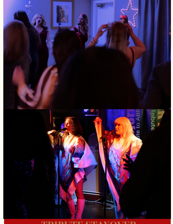
TRIBUTE STAYOVER PACKAGE FOR 2 PEOPLE

All special dietary requirements must be advised in advance. Please see Terms &Conditions page for furthur information,